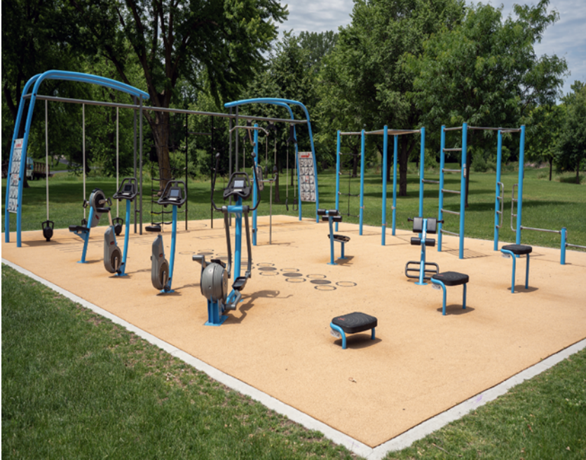
Fitness Park: $300,000