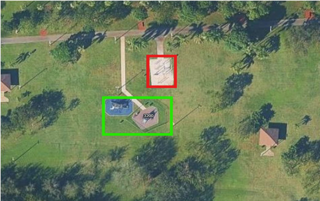
Toddler Playground: $200,000