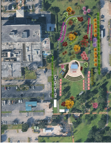
Amphitheater (Enhanced): $3,000,000