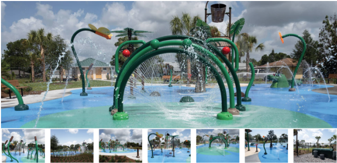
Splash Pad: $1,000,000